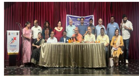
12.08.2024: Zonal Review Meeting was held in Rotary Bhavan, Manipal hosted by Rotary Club Manipal.